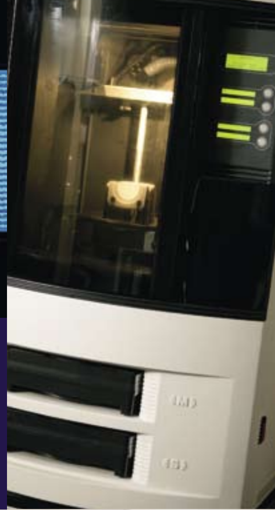
Spirax Sarco researches, designs and develops controls and instrumentation directly